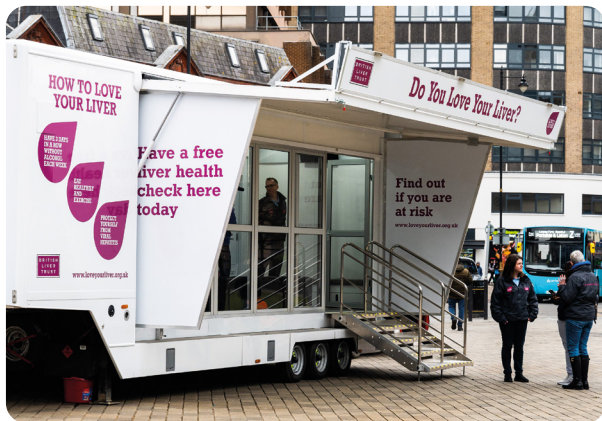
Exterior view of the mobile unit

By hiring the Love Your Liver unit, we can help you deliver targeted public health interventions and promote better liver health in your communities.